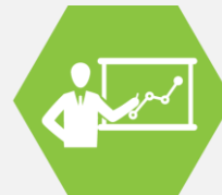
Planning & NSOs