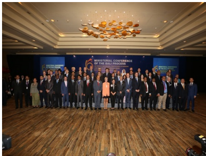
6th Bali Process Ministerial Conference, 23 March, Bali, Indonesia

The publication is the result of consultations initiated in 2013, and the subsequent process has involved a series of expert meetings as well as a detailed questionnaire distributed to all OSCE participating States in August 2016. The compendium builds upon existing ODIHR expertise in providing technical support to participating States in civil registration, identification, and population registration and reform.