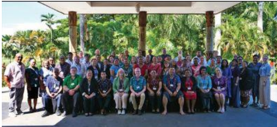
CRVS professionals across the Pacific region convene for the PCRN meeting in Nadi, Fiji