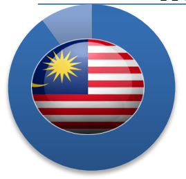
Citizen 28.7 million